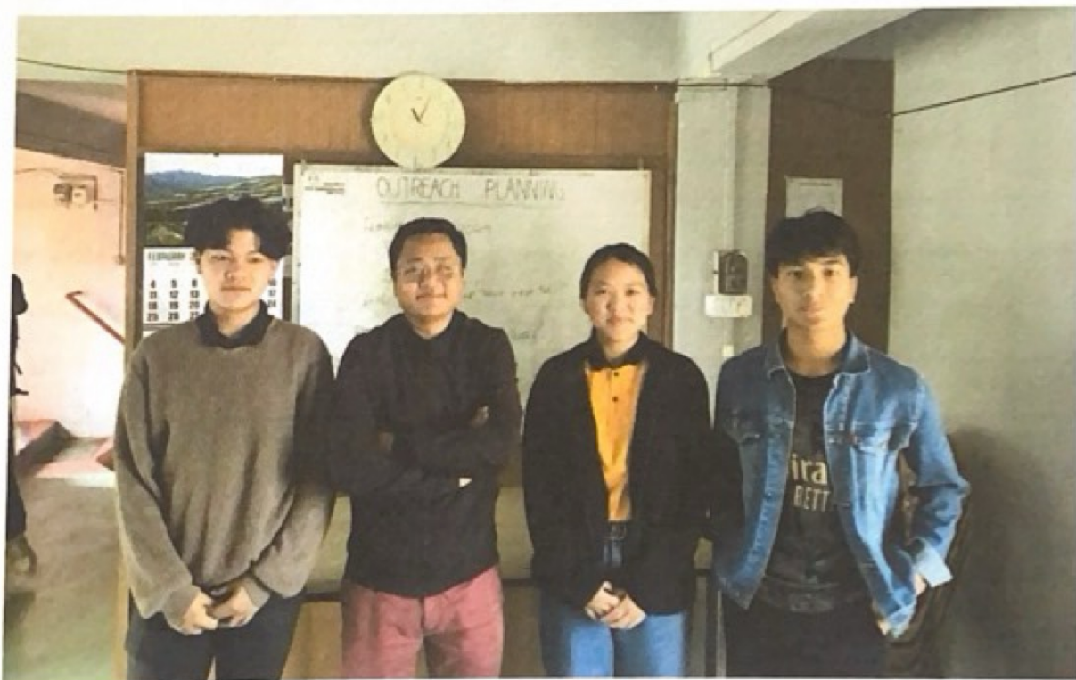
Photo no 2: Interns with the Project Manager of MHIP Drop in Centre