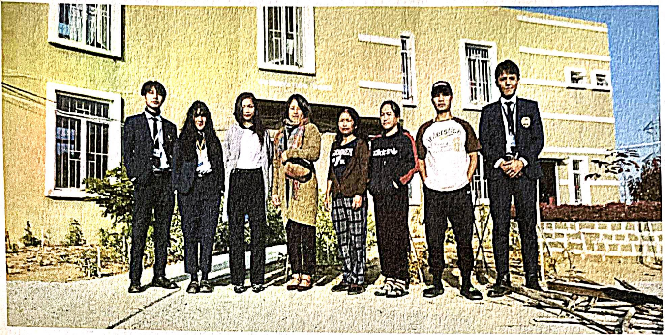
Photo 1: A picture of the interns with the staff @Lunglei Observation Home