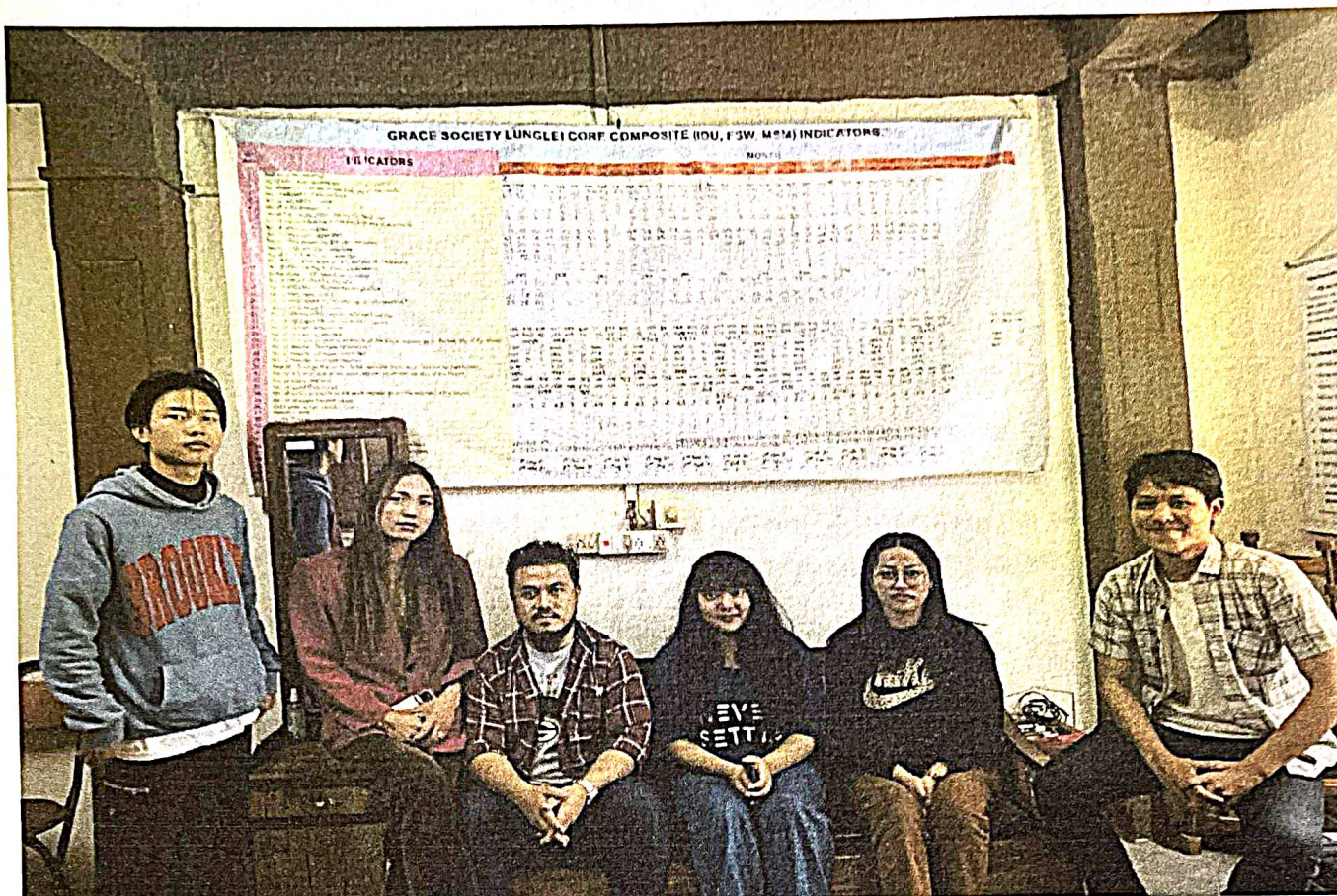
Photo 4: The interns along with the Project Manager, Outreach Worker and Peer Educator @Grace Society.