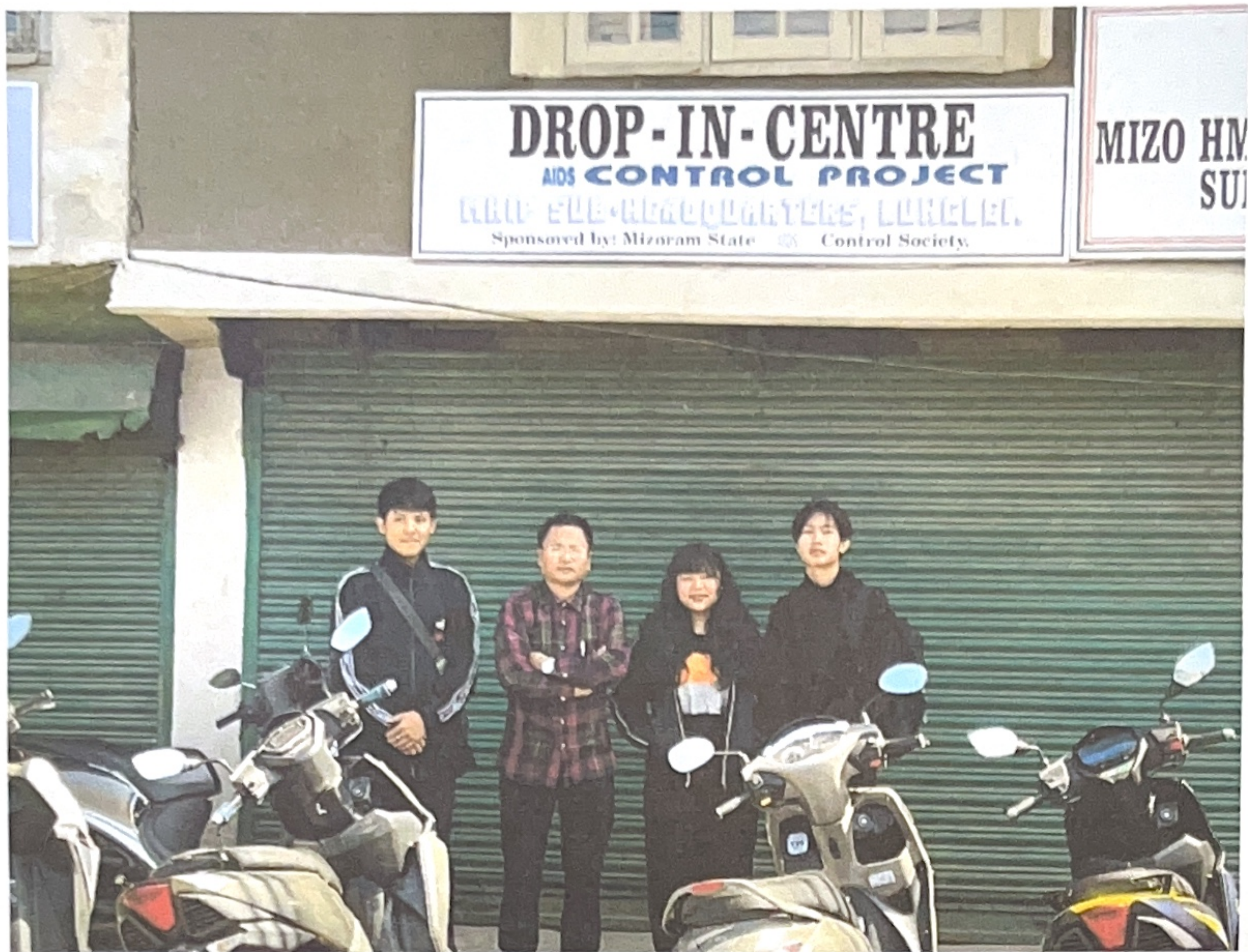
Photo 3: The interns along with the Project Manager at MHIP Drop-in-Centre.