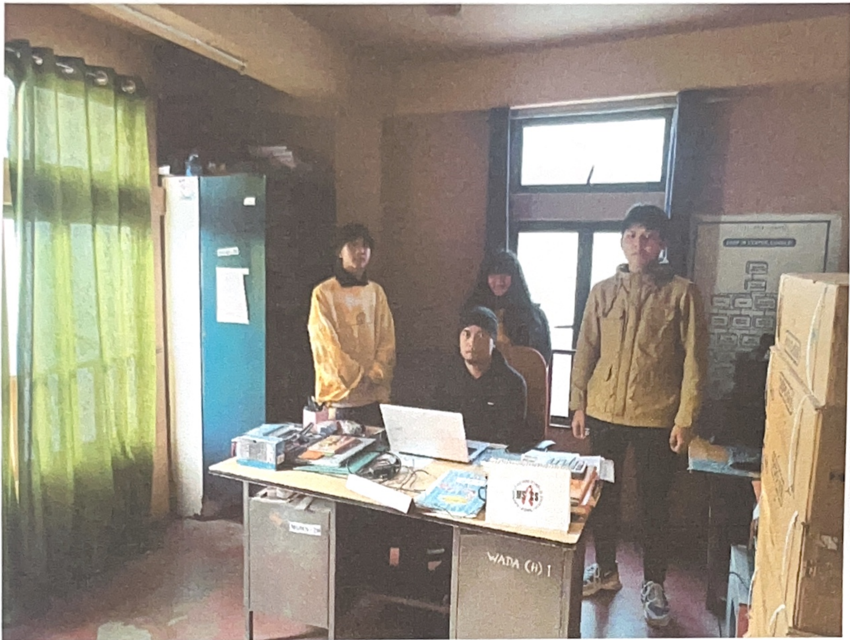
Photo 2: The interns along with the Project Manager at WADA Drop-in-centre.