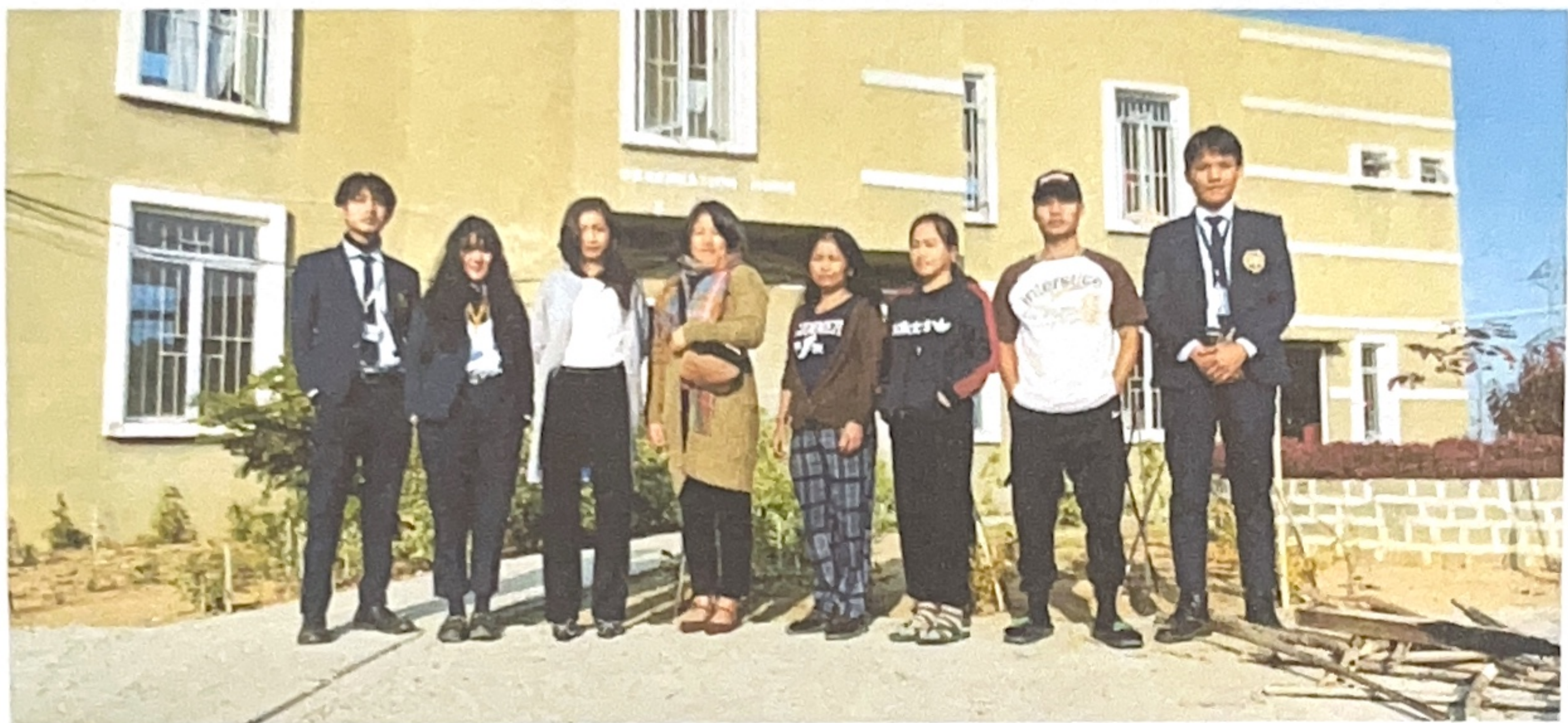
Photo 1: The interns along with the staffs at Lunglei Observation Home